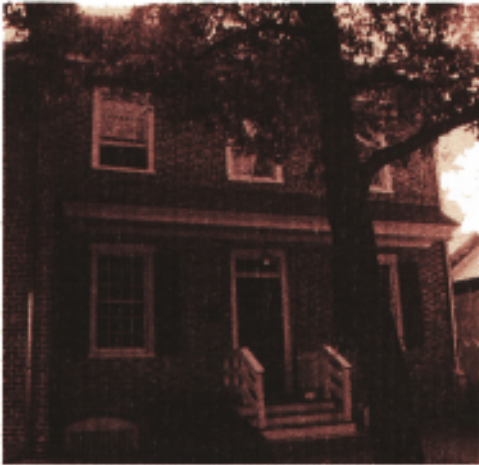
The Robert Long House, at 812 S. Ann St. in Fell's Point, serves as the Preservation Society's headquarters. Built in 1765, it is Baltimore's oldest residential structure.

PRST STD U.S. Postage PAID Baltimore, MD Permit No. 4533