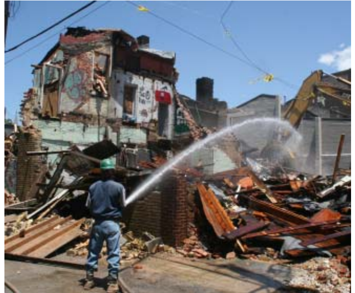
Site of the former Franciscan Friary. Ann Street at Aliceanna.